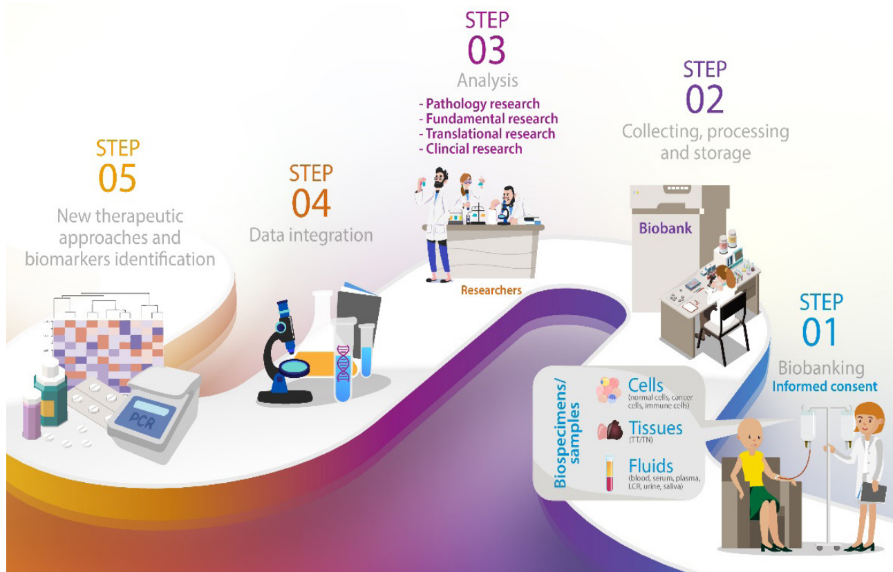
Figure 1. The Roadmap of Biobanking for oncology patients as a sustainable pipeline encompassing multiple stages. This includes the collection of samples from biobank participants and a signed informant consent ( step 1 ), collecting, processing and storage of biospecimens ( step 2 ), distribution of samples for analysis ( step 3 ), and then integration of the experimental and clinical data in an integrative mode for research progress ( step 4 ). This will enhance our understanding of disease to promote advancing research that will permit the development of novel biomarkers or therapeutic strategies ( step 5 ).

Defining the purpose of a biobank and identifying the requirements, particularly those related to funding modalities, is an essential step in its development. The development of a biobank passes through the following phases: defining its purpose, predicting requirements, and obtaining funding. An important issue is the infrastructure and optimization of the preparing techniques based on the already established management system implementation and initial operations. The latest international tendency related to biobanks is to function as a network, permitting them to maximize their potential on both the national and international levels [18]. Collaboration enhances the statistical power of studies, validates findings across different populations, and accelerates the translation of research discoveries into clinical applications.