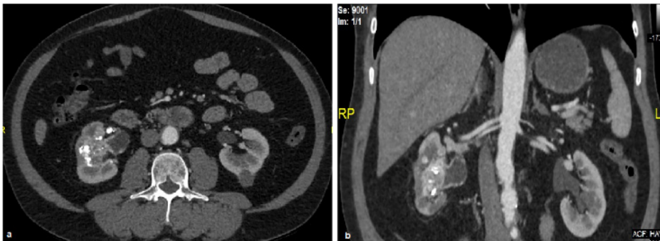
Figure 3. Axial and coronal images obtained at one month control. 3a. and 3b. Cured renal AVM with minimal parenchymal loss was demonstrated at the control imaging.