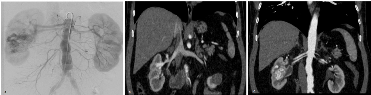
Figure 1. DSA and CT images obtained prior to treatment. 1a. DSA images obtained prior to endovascular embolization. 1b. and 1c. CT images obtained prior to treatment demonstrates enlarged renal veins and double renal arteries.

a high flow cirroid AVM supplied by two renal arteries separately with enlarged renal veins (Figure 1). The left femoral artery was also punctured and a 45 cm 6Fr long sheath was advanced to the superior and larger renal artery. Following that, a 6 Fr renal double curved guiding catheter (RDC II, Boston scientific, USA) was advanced and positioned at the ostium of the smaller arterial branch. Diagnostic angiographic images with higher frame rates (7-9 fps) were then obtained to further understand the AVM's morphology.