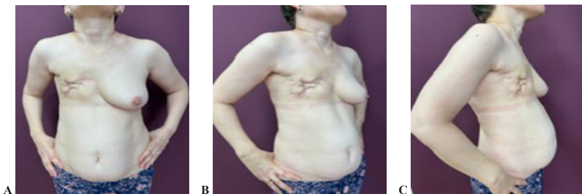
Figure 3. Patient 3 months after the lipofilling session A-C from front view to lateral view.