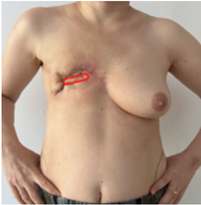
Figure 4. The position of the probe in all 3 examinations marked with red.