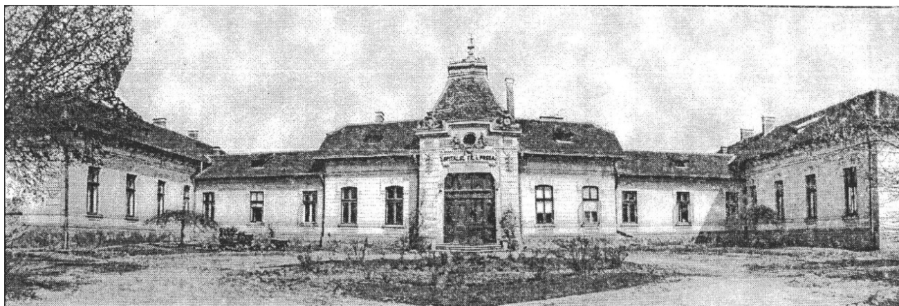
Figure 2. Theodor I. Preda Hospital, Central Pavilion, 1908.

the intersection of Boulevard Carol with the street A.I. Cuza. The houses in Mihail Kogălniceanu street were sold to G.G. Vorvoreanu, the money obtained being used for maintaining the hospital [6].