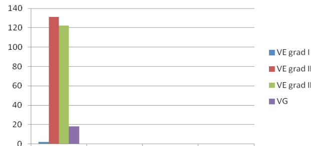
Figure 2. Variceal bleeding depending on the grade of the varicose veins - in a graphic form.

in patients with varices grade II and III. In our series there were 2 patients (0.73%) with bleeding from esophageal varices grade I, 131 patients (47.98%) with hemorrhage from esophageal varices grade II and 122 patients (44.7%) with bleeding from varices grade III. Gastric varices hemorrhage was found in 18 patients (6.59%) (Figure 2).