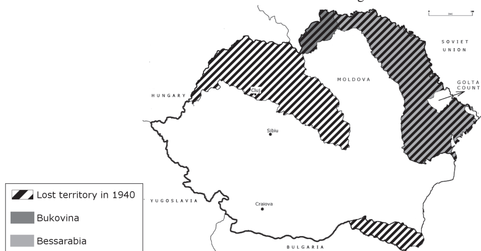
Map 1. Map of Romania with the lost territories in 1940.

Exanthematous eruption (Fig. 2) occurs in the days 4-8 after onset. In the first phase small pink papules appear, located on the sides of the thorax and abdomen and shoulder region, and, in the severe forms, on the entire skin, except from the face, palms and soles. The papules were slightly revealed with irregular contour and disappeared under