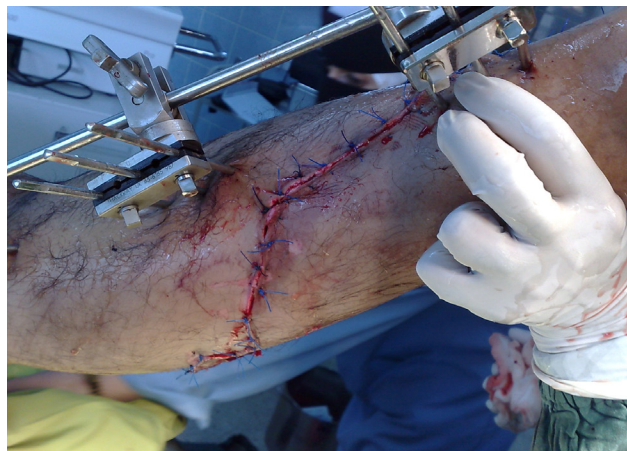
Figure 2B. Open fracture of the tibia, type IIIB, with fixation with external fixator and primary closure of the skin.