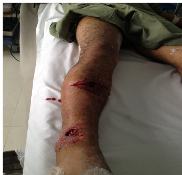
Figure 1A. Open fracture of the tibia, type II.

Ninety-six wounds were closed by primary closure (81.8%) (Table II). They included 36 wounds of open femoral shaft fractures (type I, II, IIIA, IIIB, IIIC), 58 wounds of open tibial shaft fractures (type I, II, IIIA, IIIB, IIIC) (fig. 1 and 2) and 2 open calcaneal fractures of type III. The wounds of primary closure were healed within 2 weeks.