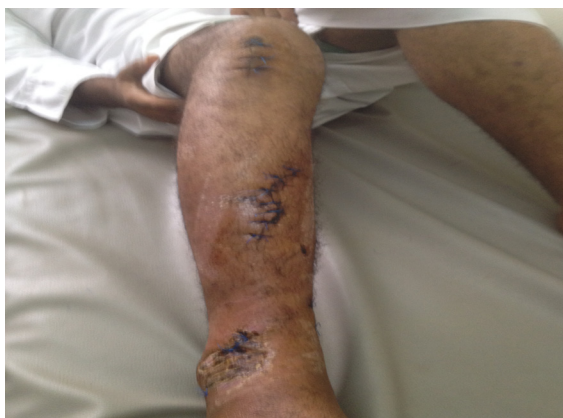
Figure 1B. Open fracture of the tibia, type II, with fixation with unreamed intramedullary nail and primary closure.