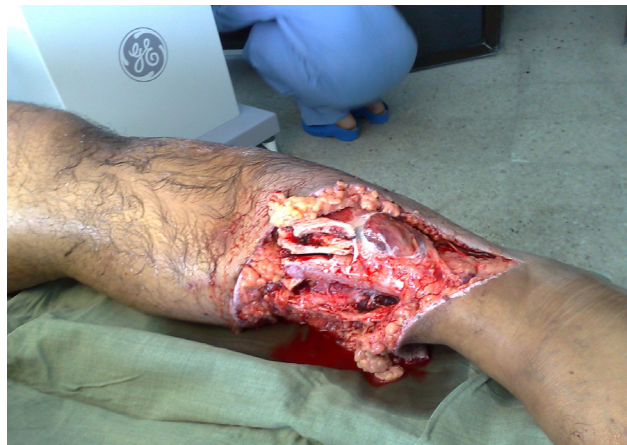
Figure 2A. Open fracture of the tibia, type IIIB.