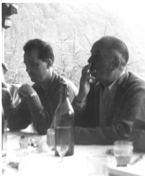
At a dinner in my company.